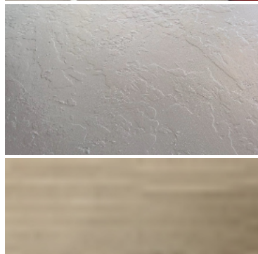
PICTURES ABOVE CLOCKWISE: Broom Finish on Balcony, Smooth/Slurry Coat with Texture Coat outdoors with forklift marks, Broom Finish on a Deck, Broom Finish on Smooth Coat close up, Skip Trowel Finish with Deck Seal Mist Gray, Pumping to 3 rd Floor Balcony.

For additional installation examples, images and training Videos, visit us online, call or email: